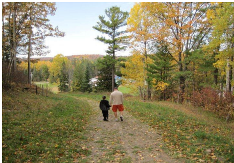
An Autumn Walk (Kim Skinner)

Recently we asked for your great photos of Batawa. The following are two wonderful submissions that we received from people who read the bulletin electronically. These great images showcase two places where fond memories have been created. To submit your own great photo, please send images to cdc@batawa.ca . Keep the great photos coming!